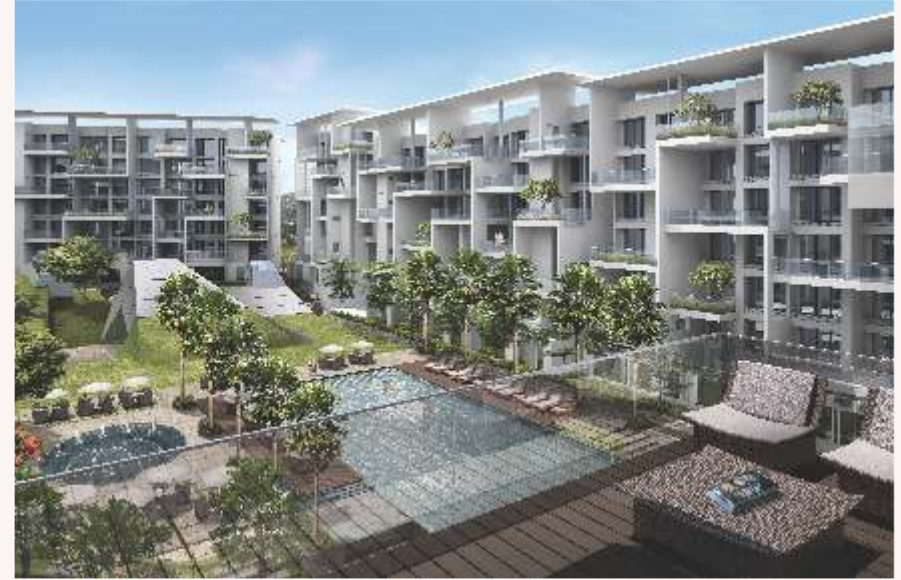
Rohan Kritika, Sinhadgad Road, Pune