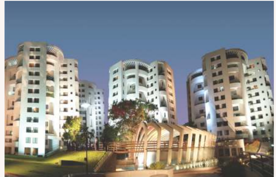
10 Kasturkunj, Bhosale Nagar, Pune