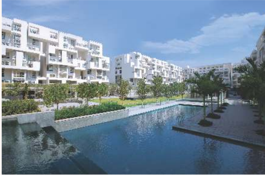
Rohan Mithila, Viman Nagar, Pune

With 10 million square-feet of living spaces and 8000 happy families, our best salesmen are our home owners and the most trustworthy brand ambassadors.