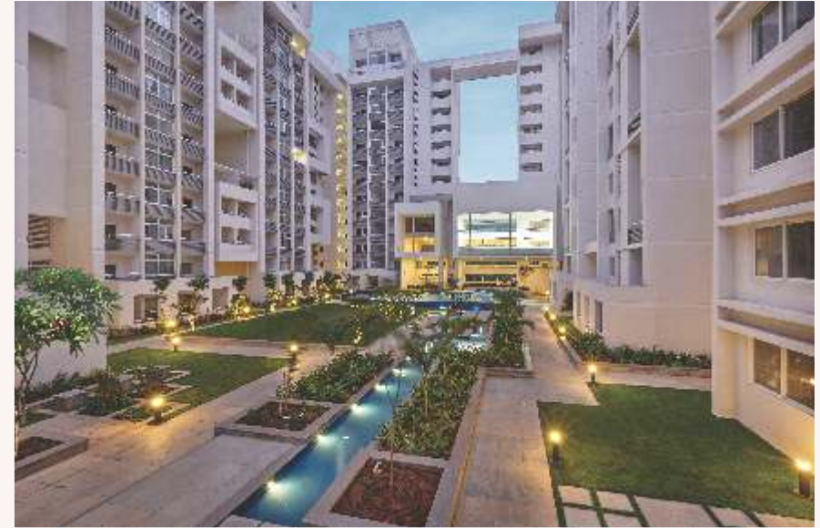
Rohan Avriti, ITPL Road, Bengaluru