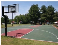
Basket Ball Court